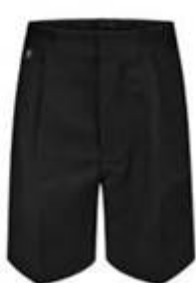
Plain black tailored. knee length shorts