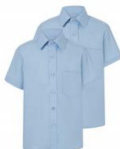
Blue short sleeved, full buttoned shirts