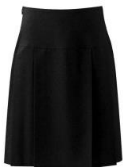
Knee length black pleated skirt