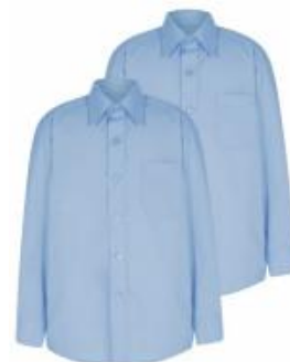
Blue long sleeved, full buttoned shirts

No buckles, belts, jersey material, skinny fit or tight fitting